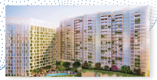
Leela Hotel & Residences