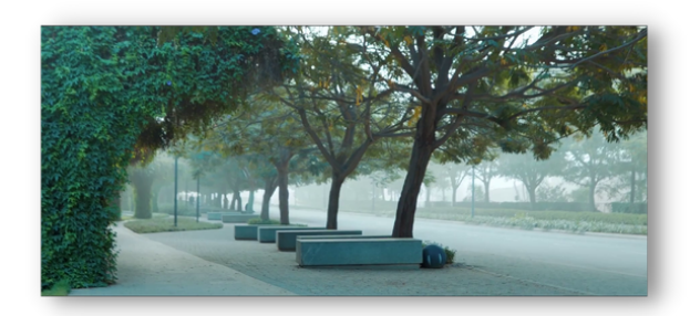
In Midst of Nature