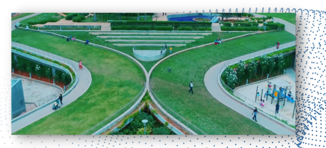
Well Developed Walking Tracks