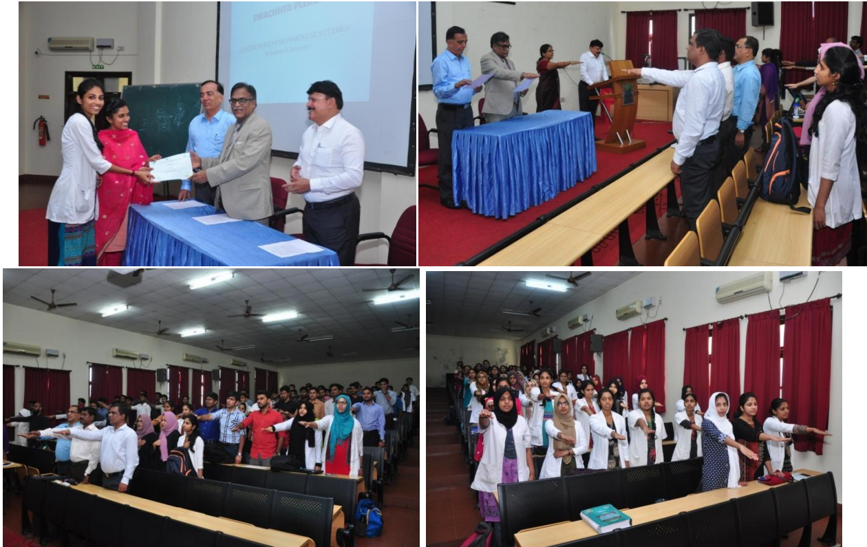
Prize distribution and Swachhta Pledge