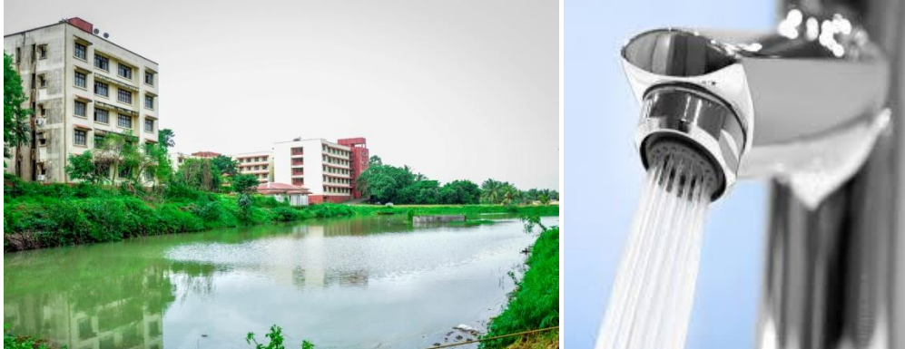
Rain water harvesting pond

3) Rain water harvesting: University has measures for rain water harvesting. A large rain water harvesting pond of two acres ensures underground water recharge. In addition 8 roof top harvesting systems have been installed from past one year. Water saving fixtures is fitted for conservation of water. Water audit is done on regular basis.