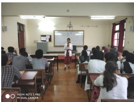
Seminar presented by students

Students presented seminars on effects of plastic on health and alternatives for plastic. The students had interaction on traditional ways of lifestyle without use of plastic. Students also took a pledge to avoid plastic.