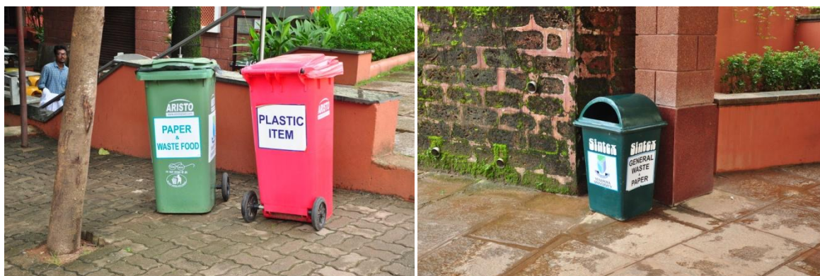
Dustbins for effective segregation of waste

1) Cleaning of campus: The University Housekeeping department maintains an effective campus cleaning system regularly. A register was made to record the number of dustbins displayed in all buildings and common areas of the University campus. The dustbins are labeled for segregation of waste. This will help to maintain record of daily garbage collection and disposal.