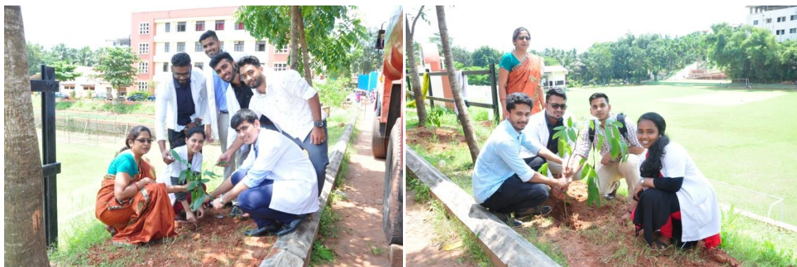
Plantation by students

2) Tree plantation: Two saplings of Swietenia mahagoni were planted by the students in the campus.