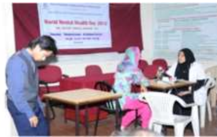
MBBS and BSc Nursing students performed skit on 'Mental Health'.