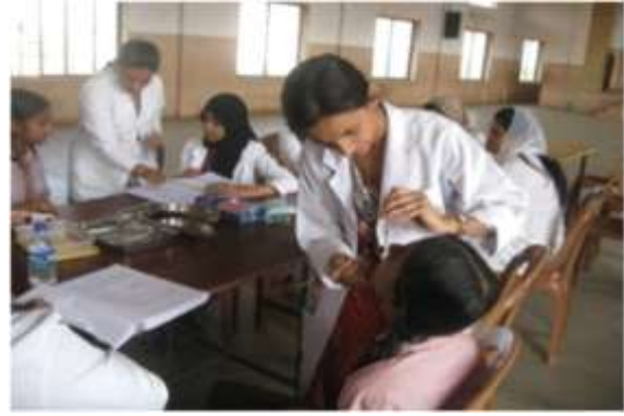
Bharath School Dental Screening Camp