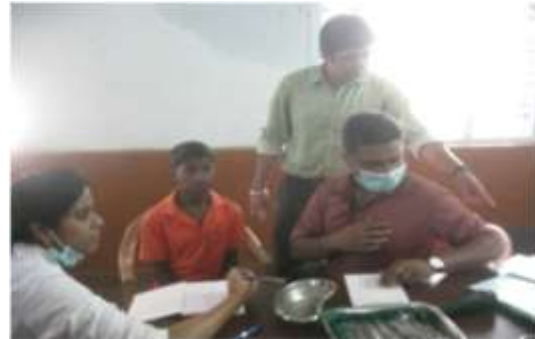
14. Yeyyadi Camp on 18.08.2013