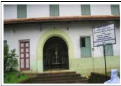
A. Kotepura -I B.Kotepura II