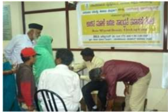
Medical Camp Photos