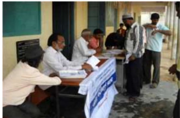
Bhadravathy Yen Card Camp