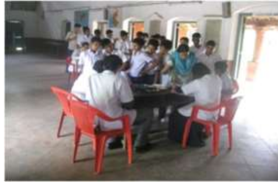
St.Lawrence School Dental Screening Camp