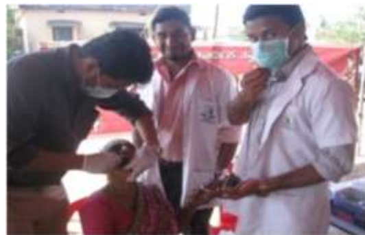
25. Nithyanandanagar Camp B.C Road