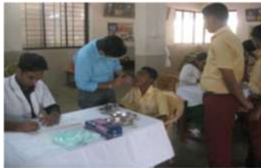
31. Olavina Halli NSS Dental Camp