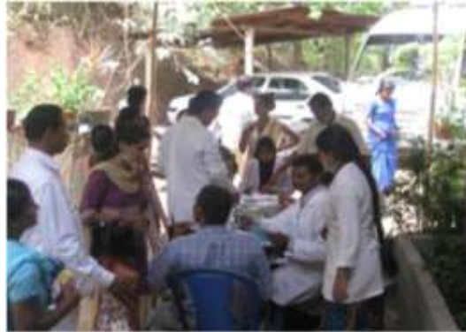
24. Kumpala Camp