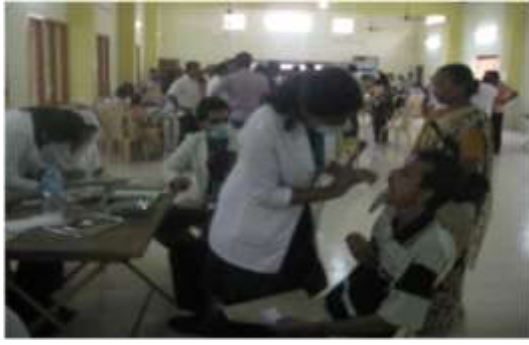
28. Zulekha Denture Camp