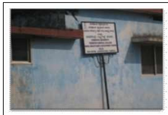
B. Ashrya Colony, Lakshmi Gudda