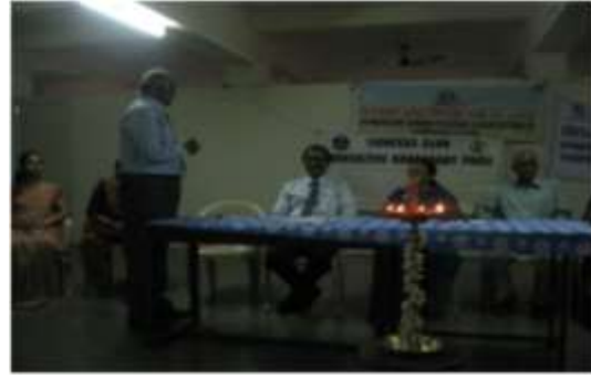
30. Shirali camp