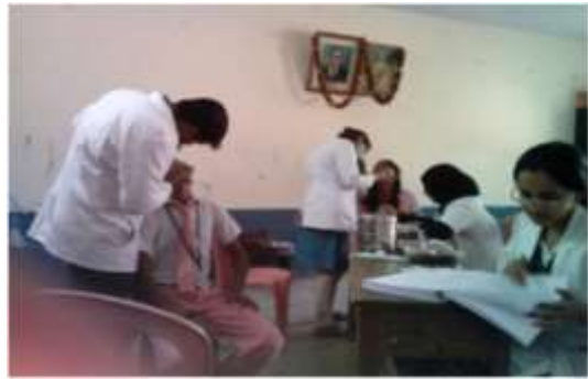
27. Pudubettu camp