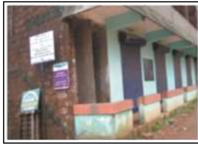
Urmene - Natekal