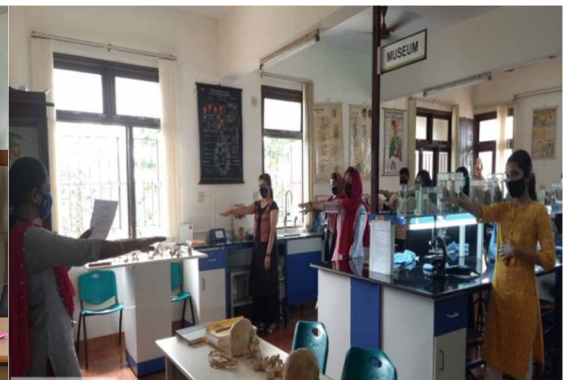
Ektha Divas Celebration