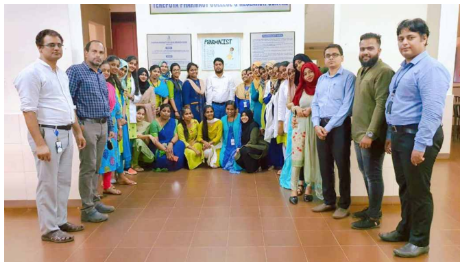
World Pharmacist Day