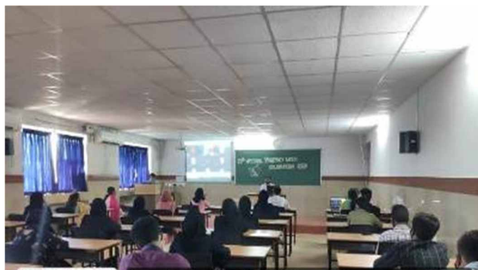
National Pharmacy Week