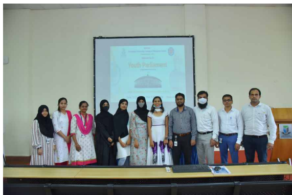
National Youth Day Celebration