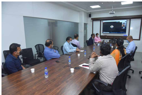
Induction Program - Deeksharambh