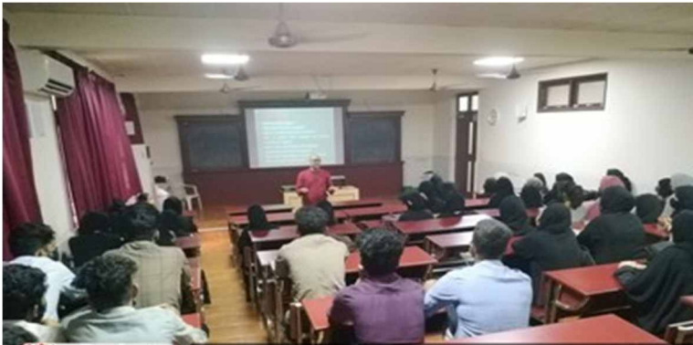
Awareness program on Anti- ragging