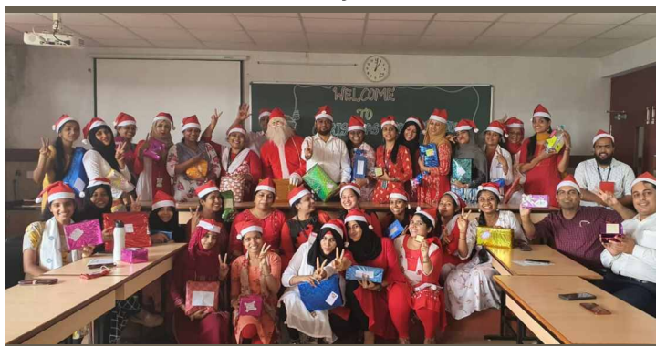
Christmas Day Celebration