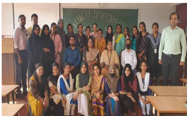
Faculty Development Program for Non Teaching Staff