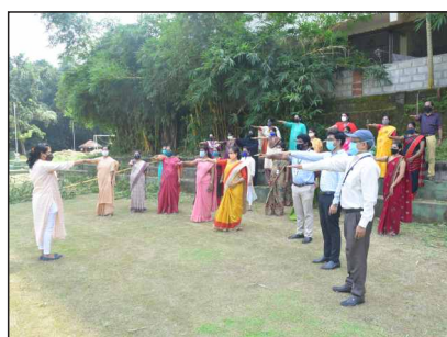
OATH taking by faculty against COVID-19 on 20-10-2020