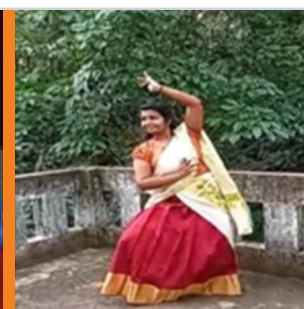
Nurses Day Cultural Competition on 12-5-2020