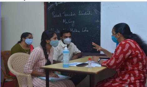
Parent teacher meeting on 7-12-2020