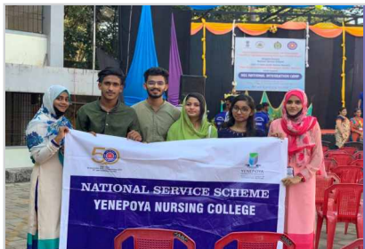
Student's participation in National integration Camp at Padua college inauguration (NSS Unit-II, YNC) on 23-02-2021