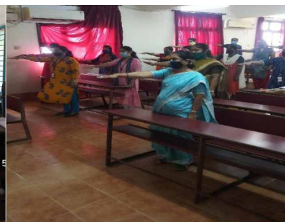
Rashtriya Ekta Diwas Pledge by Faculty(NSS Unit-II, YNC) on 4-11-2020