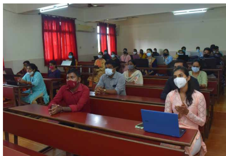
Staff development Programme on Google Technology : Google classroom and Google form on 11-07-2020