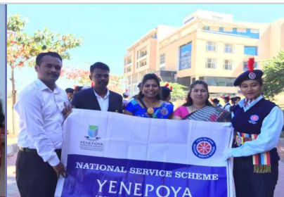
Ms. Asiya [B.SC Nursing students] With Organizers in State level Pre- RD training