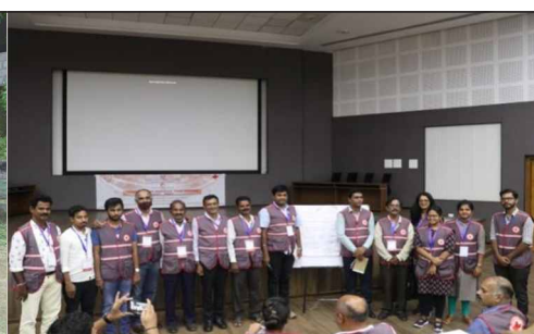
Disaster Response Team Training for Faculty by Indian Red Cross Society on 4-9-2020