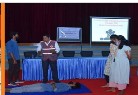
Red cross faculty training on first aid management to IB.Sc Nursing Students on 22-2-2021