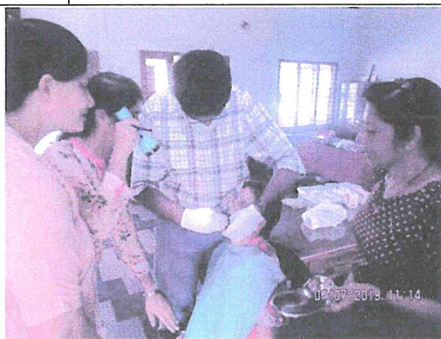
Dental camp at OlavinaHalli Rehabilitation Centre, Kenya