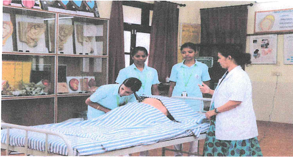
Pic 3: Faculty demonstrating antenatal assessment in OBG lab

Nursing Foundation lab is mainly utilized for demonstrating the basic nursing procedures as well as practice of these procedures by I Year B.Sc nursing students. This laboratory is also utilized for teaching Medical and surgical nursing skills for II and III year B.Sc nursing students, Post Basic B.Sc Nursing students and post graduates.