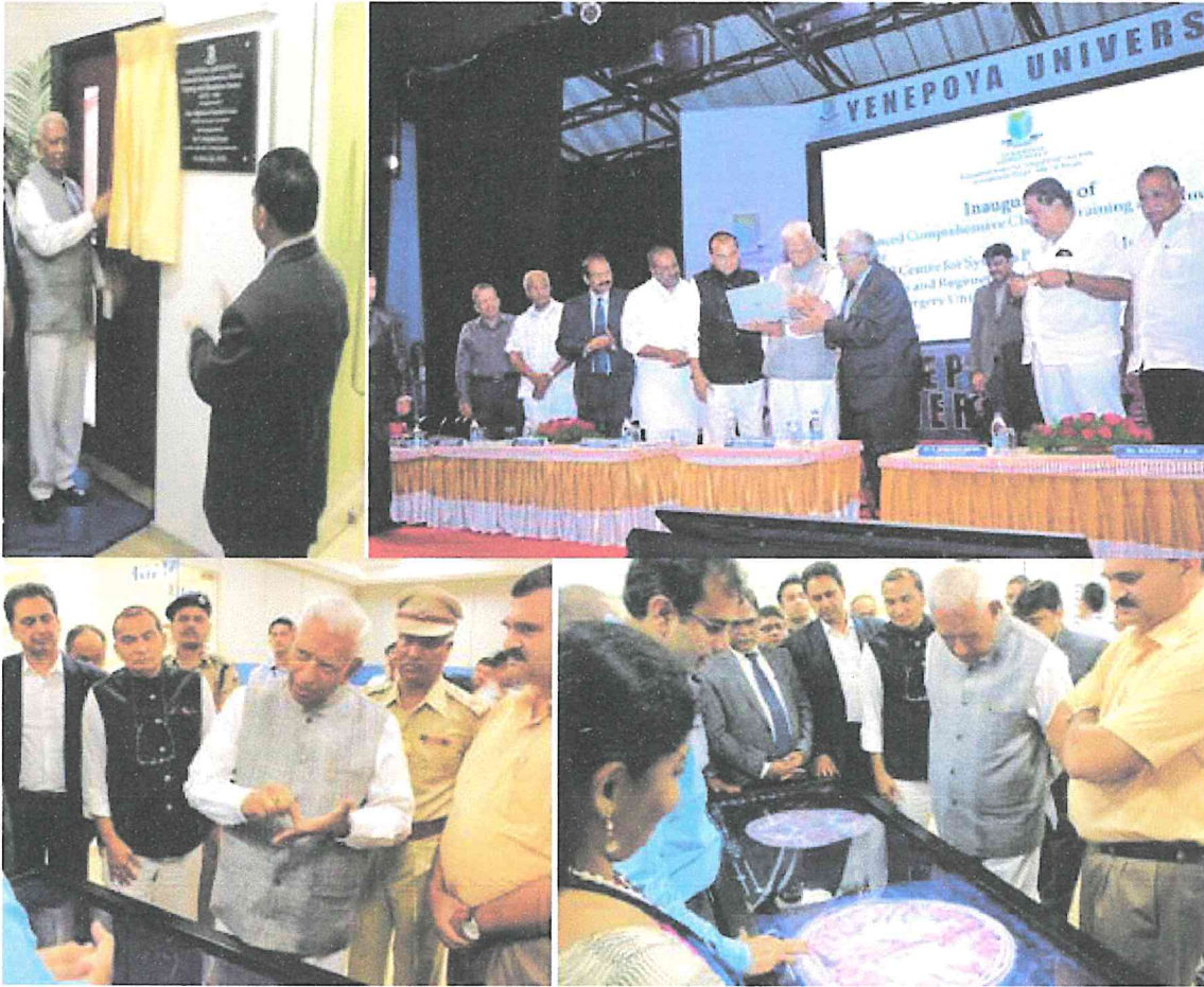
Inauguration of ACTSYEN by the Governor of Karnataka Vajubhai Rudabhai Vala, held at Yenepoya on 30 th July 2016