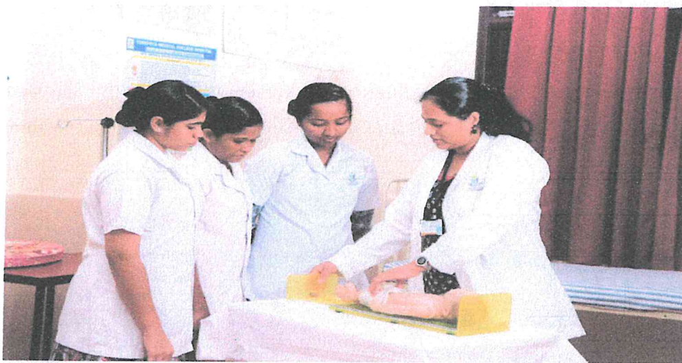
Pic 4: Faculty demonstrating assessment of length of newborn in child health nursing lab

OBG nursing laboratory is utilized for teaching and practicing obstetric skills such as antenatal assessment, assessment of female pelvis and newborn skull for final year B.Sc Nursing students, first year Post Basic B.Sc Nursing students and for post graduates.