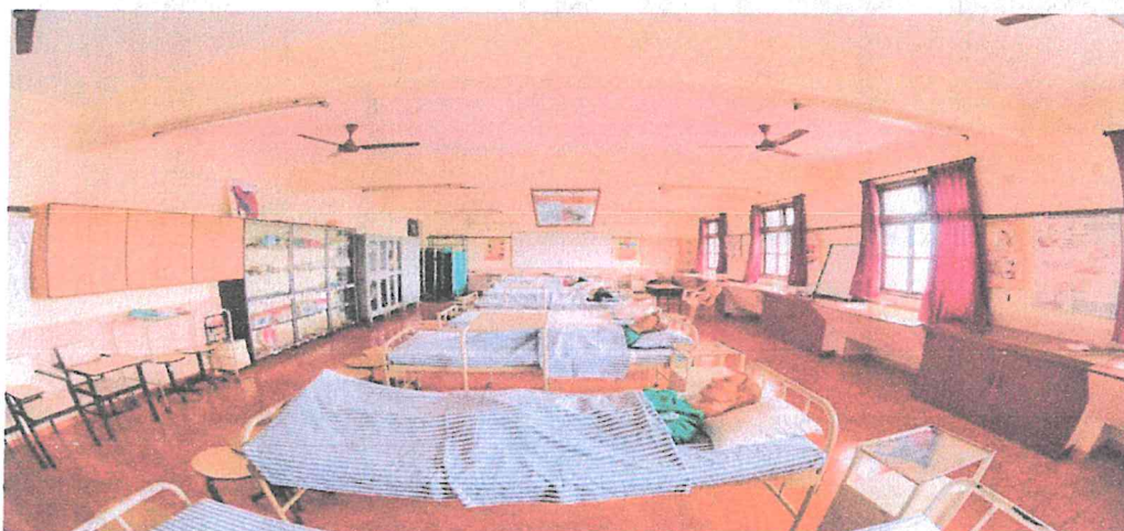
Pic 1: Nursing Foundation Lab

Yenepoya Nursing College has various laboratory facilities for practicing clinical and nursing skills for the students. It has Nursing Foundation Lab, OBG nursing lab and Child health nursing lab facilities. Nursing Foundation Lab was established in 2002 during the establishment of the college. Maternity and child health lab was also established in 2002 and in 2014 this lab was separated and two separate laboratories were made, namely OBG nursing lab and Child health nursing lab. All these labs are situated in the first floor of the Yenepoya Nursing college building.