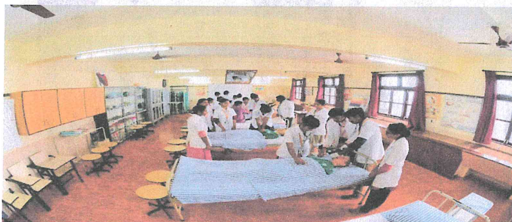
Pic 2: Students practicing Nursing skills under supervision of faculty