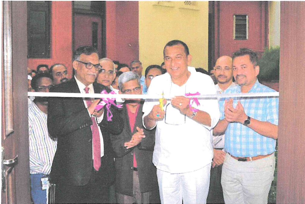
Inauguration of ASSEND by our Honorable