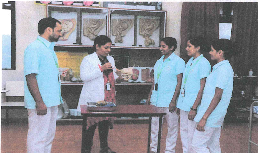
Pic 3: Faculty teaching characteristics of female pelvis in OBG lab