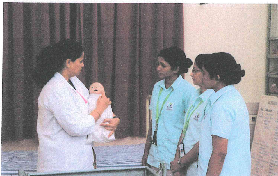
Pic 4: Faculty demonstrating assessment of newborn in child health nursing lab